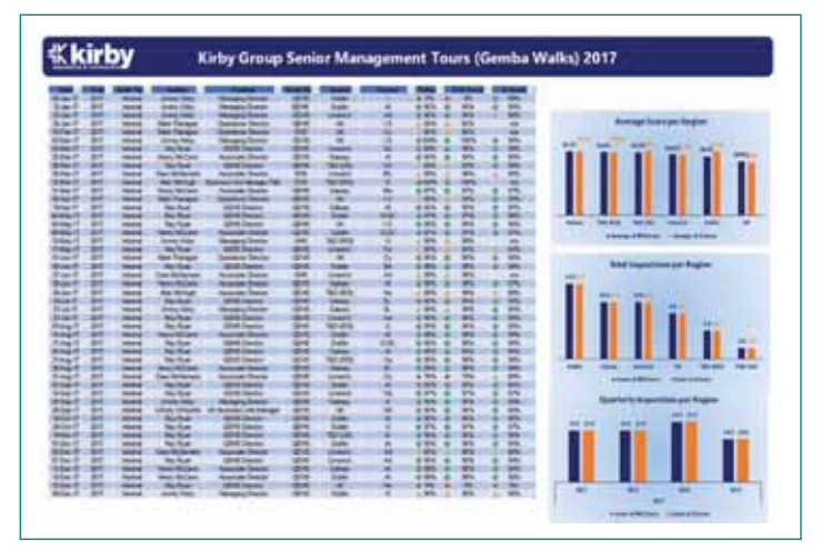
Figure 3. Kirby Senior Management QEHS Senior Tour (Gemba Walk) Register 2017