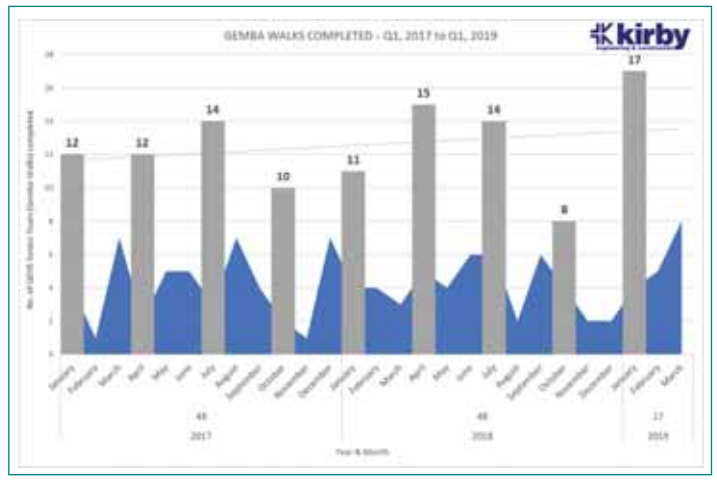
Figure 2. QEHS Senior Manager Tours (Gemba Walks) completed – 2017 to 2019

From a base level of 0 in 2015, to move to trial during the last quarter of 2016, and to roll-out in 2017 resulted in a large change of thought within the company strategy. A total of 48 Gemba walks were completed in 2017, and then repeated in 2018, and in quarter 1&2 of 2019 there were 42 completed – the largest number for the first two quarters.